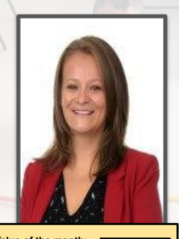
Value of the month: Respect Islamic value: الإحترام Learning Skills Focus Innovate and Create

On Monday, we will be starting our new topic 'Going on a Journey' where we will be blasting off into space, meeting some aliens and learning all about the 'Man on the Moon'. We are extremely excited to start this adventure.