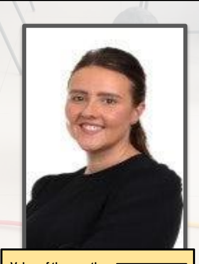
Value of the month: Respect Islamic value: الإحتراء Learning Skills Focu Innovate and Create